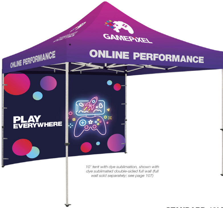
10' tent with dye sublimation, shown with dye sublimated double-sided full wall (full wall sold separately; see page 107)