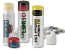
NATURAL BEESWAX LIP BALM